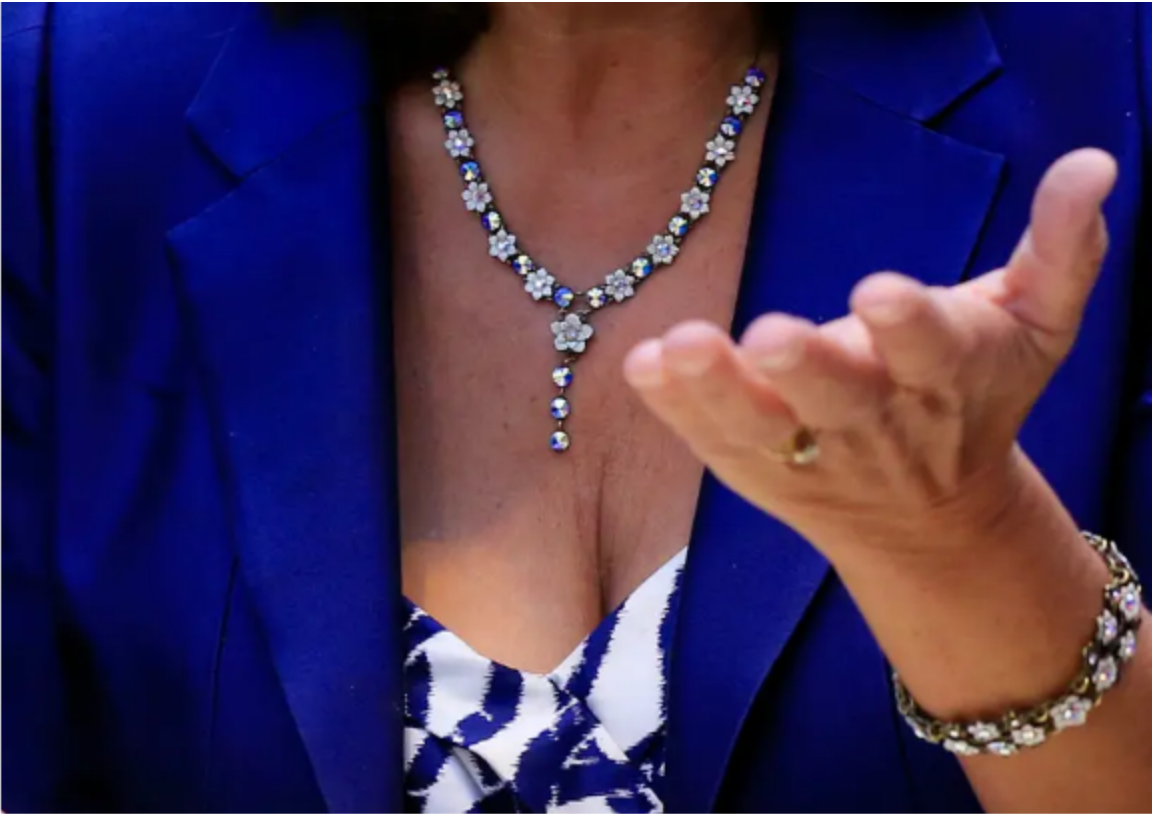
Baroness Altmann said easy and good-value options for looking after pensions throughout retirement are lacking for the mass market

Alistair Byrne, of State Street Global Advisors, said: "People struggle to see beyond the near-term future and cannot always access the type of advice and support they would like. As an industry we need to continue simplifying what we offer, providing guidance and support, and easy paths to follow."