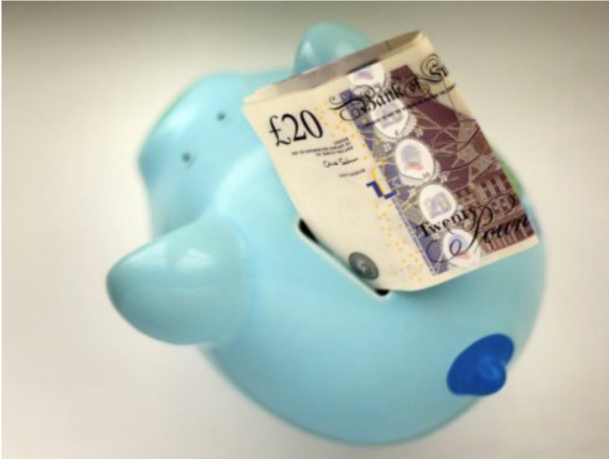
People are risking sleepwalking into retirement with savings which may not survive for as long as they do, a report warns

Around three in four people risk outliving their savings in retirement, a report looking into the impact of the pension freedoms indicates.