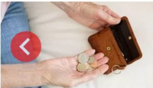
State pensioners who have £18,200 or over to their name 'warned'