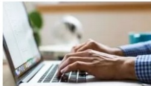
State pensioners face having to 'choose self-employment' over 'retirement'