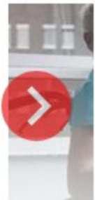
State Per with Lab

"The rules were less generous for women having kids who were often traditional homemakers." He adds: "A widow's rate is usually substantially higher because it's the full state pension plus some inherited state pension on top."