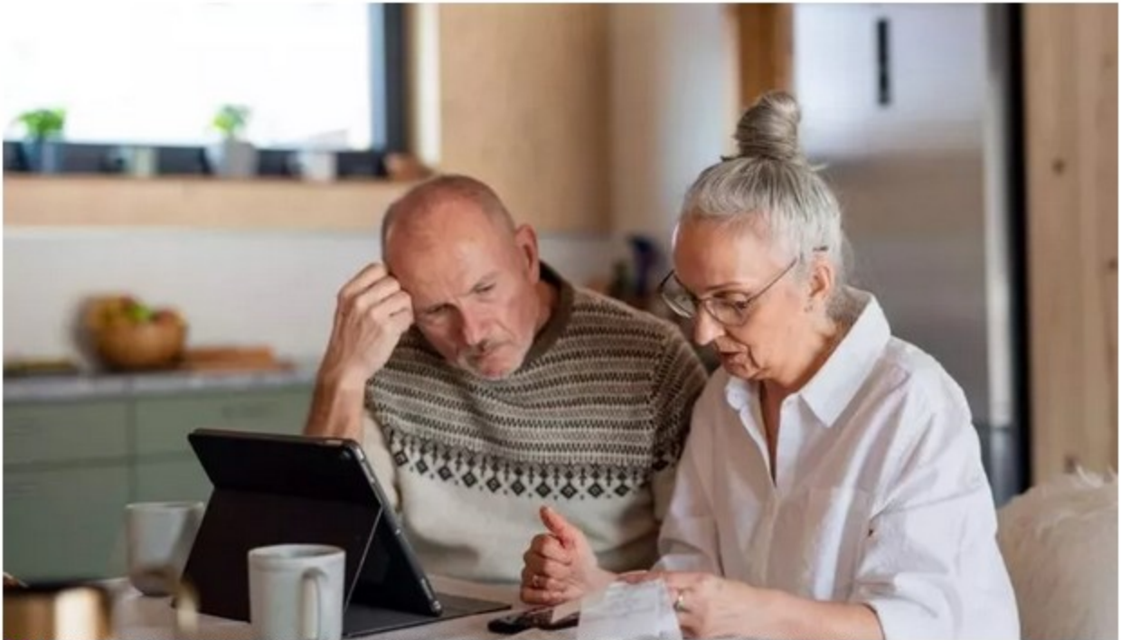
State pensioners who live '200 miles away' will be paid £3,500 less

You could be getting £70,000 less than others depending on your age, gender and location , state pensioners have been warned. Analysis by This is Money found official state pension records show "huge inequalities between age groups – with older pensioners winning out."