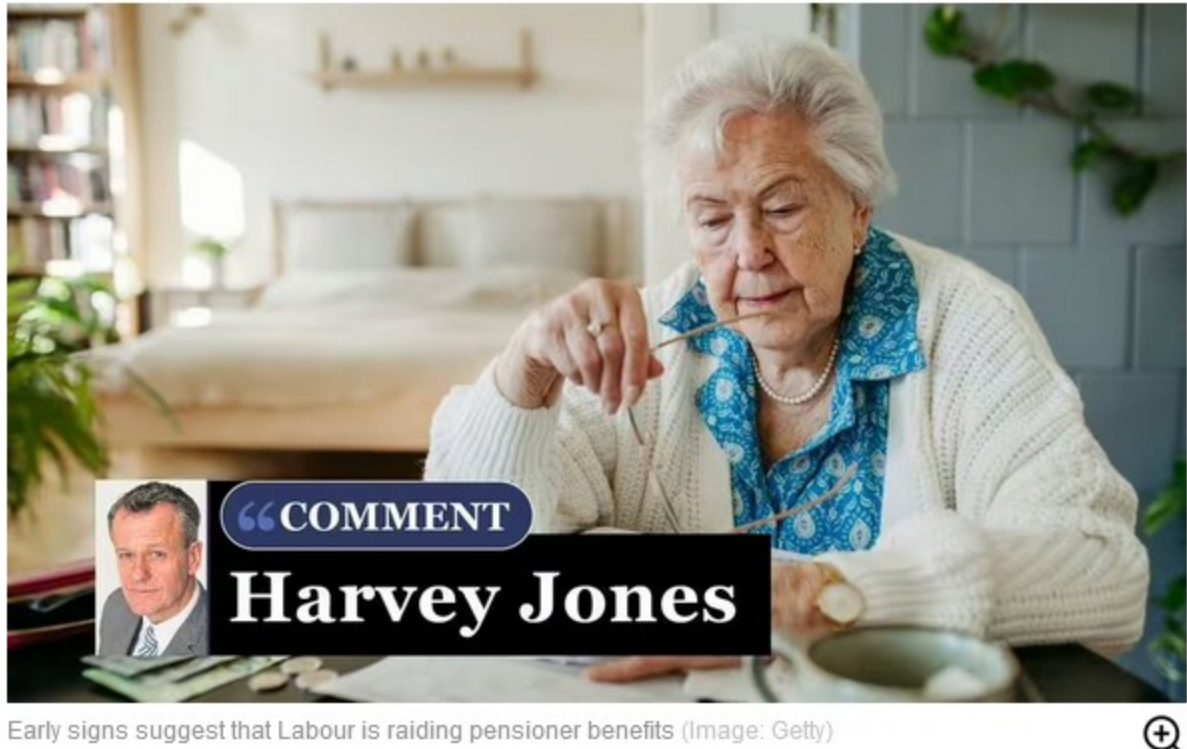
Early signs suggest that Labour is raiding pensioner benefits

Pensioner benefits have been squeezed for years and the assault looks set to intensify as Labour chancellor Rachel Reeves takes money from the older generation and gives it to needy train drivers.