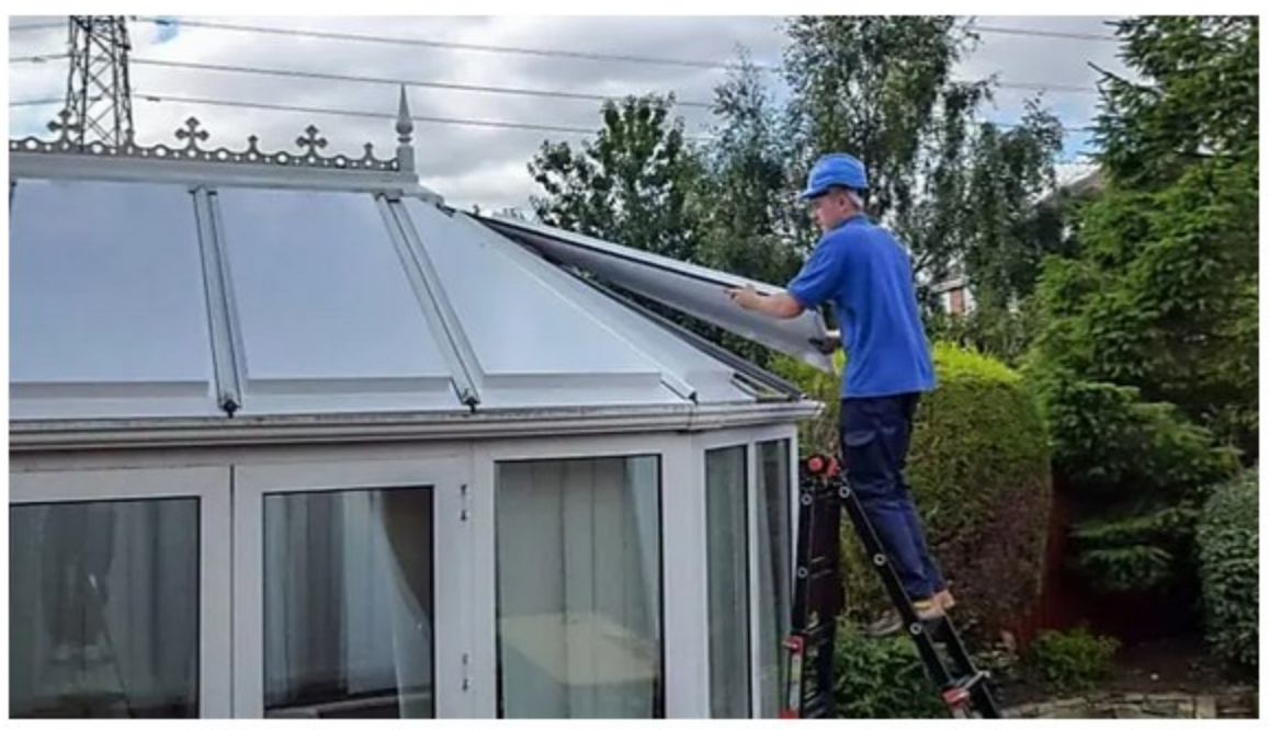
This Is How Much A New Conservatory Roof Should Cost In 2024 (See Prices)