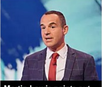
Martin Lewis points out key flaw in pension rise to £460 as millions 'get less'