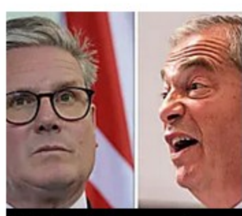
Winter fuel payment double standards exposed as Farage unearths Starmer tweet