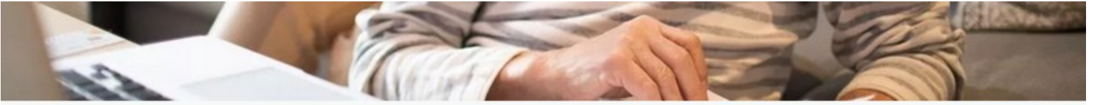
Nearly 10 million older people will no longer be eligible for winter fuel payments this year