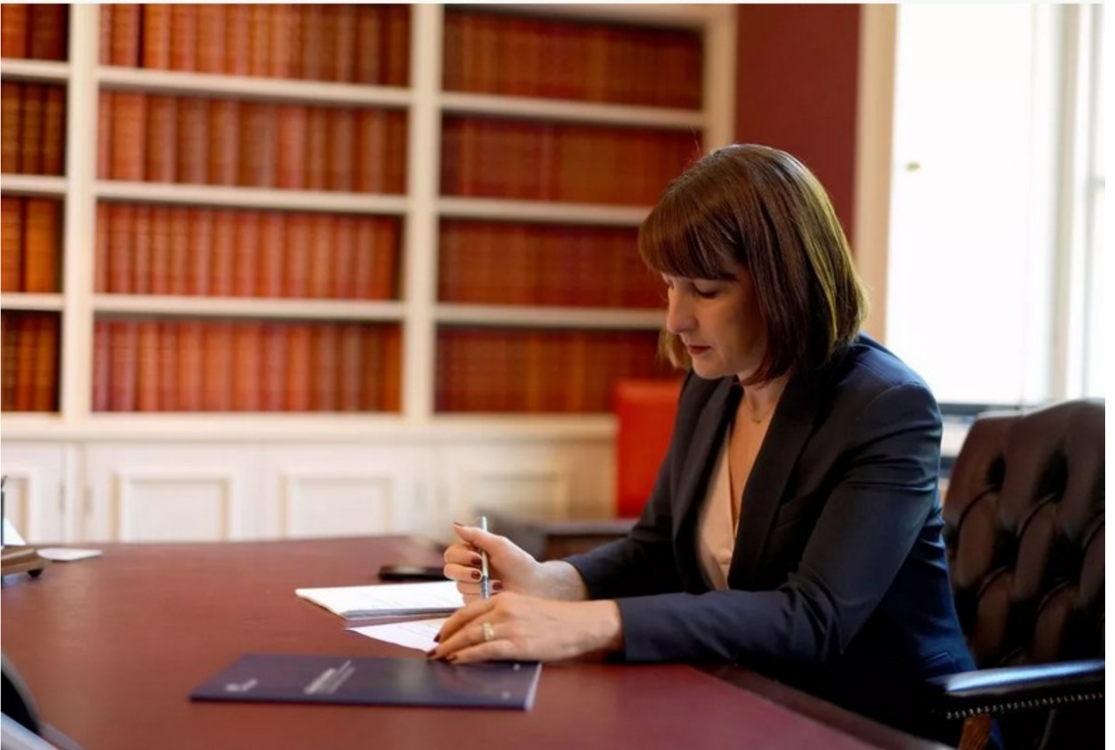
Chancellor Rachel Reeves is grappling with a £22billion black hole in the public finances left by the Tories

Vital winter fuel payment advice given to worried pensioners by Angela Rayner