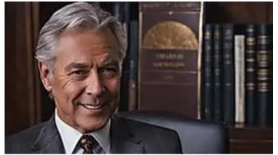
Barnet: £19.99 Will-Writing Service Legacy Wills & Estate Planning

Sir Steve Webb, a former minister for pensions and now partner at Lane Clark & Peacock, told the i newspaper the Government could decide to set up a hardship fund instead. He said: "The 'black hole' number for this year makes it unlikely they will pay anything this year. They could well end up saying they don't believe that compensation is needed."