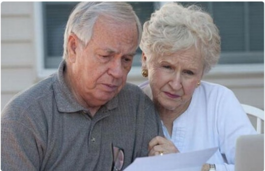
State pensioners warned new rule is 'worse than axing Triple Lock'