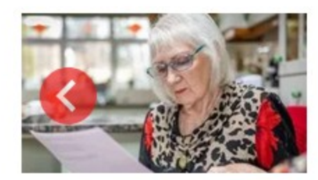
State pensioners will wake up to six payments worth £1,369 in December