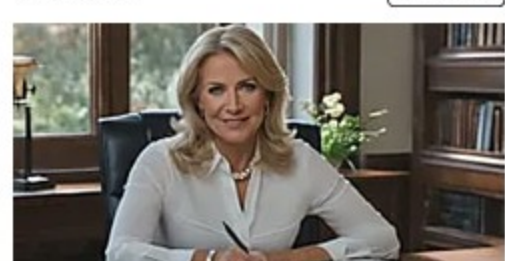
Barnet: £19.99 Will-Writing Service Legacy Wills & Estate Planning