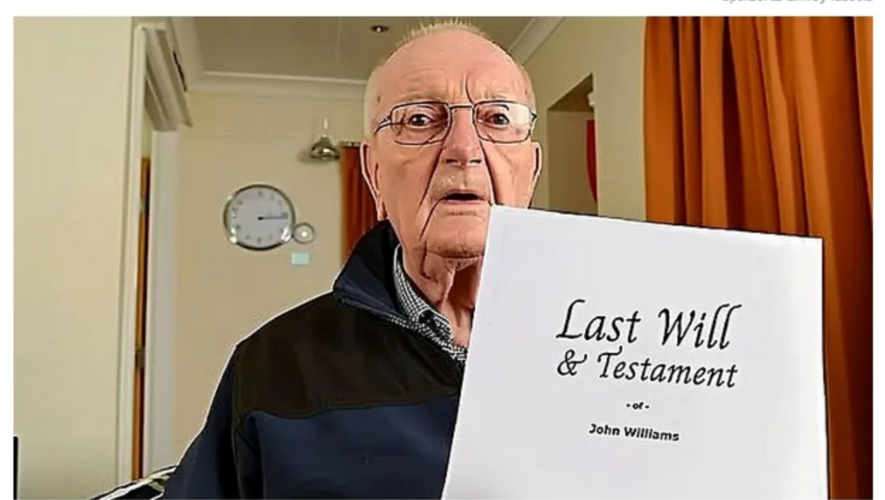
No Joke: This Is The Actual Cost Of Drafting Your Will