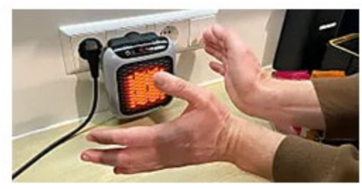
Heat Any Room In 2 Minutes & Save Big On Heating Bills With This Device

The Chancellor is considering increasing national insurance on employers' pension contributions but self-employed people could be spared the change. Rachel Reeves is also expected to use Wednesday's Budget to lower the threshold for when employers start paying the tax - with the two