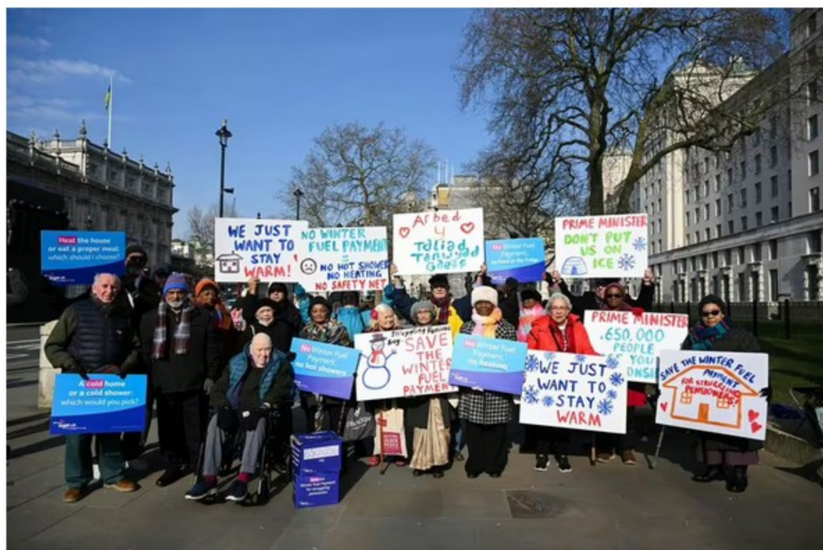
Age UK delivered a petition on the winter fuel payment to Downing Street