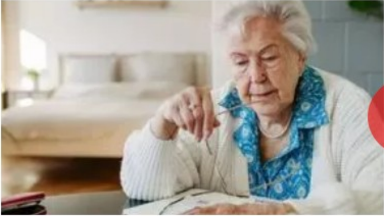
Fury over suggestion state pension age could be increased to 80