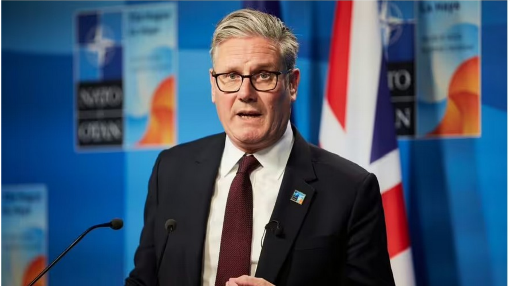
Keir Starmer has been warned against a stealth tax raid

17:00, Sun, Jul 6, 2025 | Updated: 18:36, Sun, Jul 6, 2025