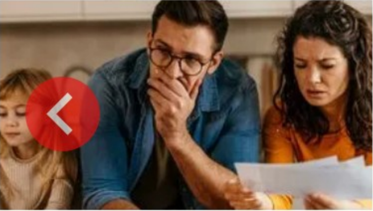
Top 45% tax rate now hitting Middle Britain